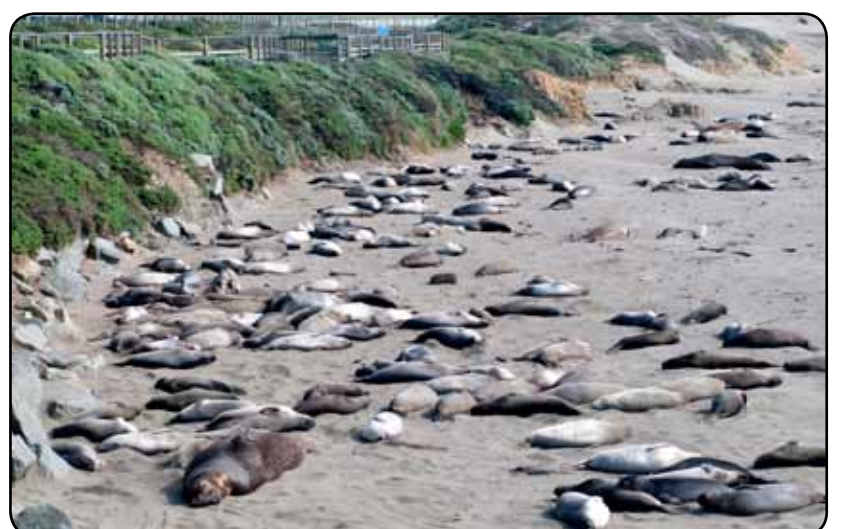
Elephant Seal Rookery with observation platform near San Simeon