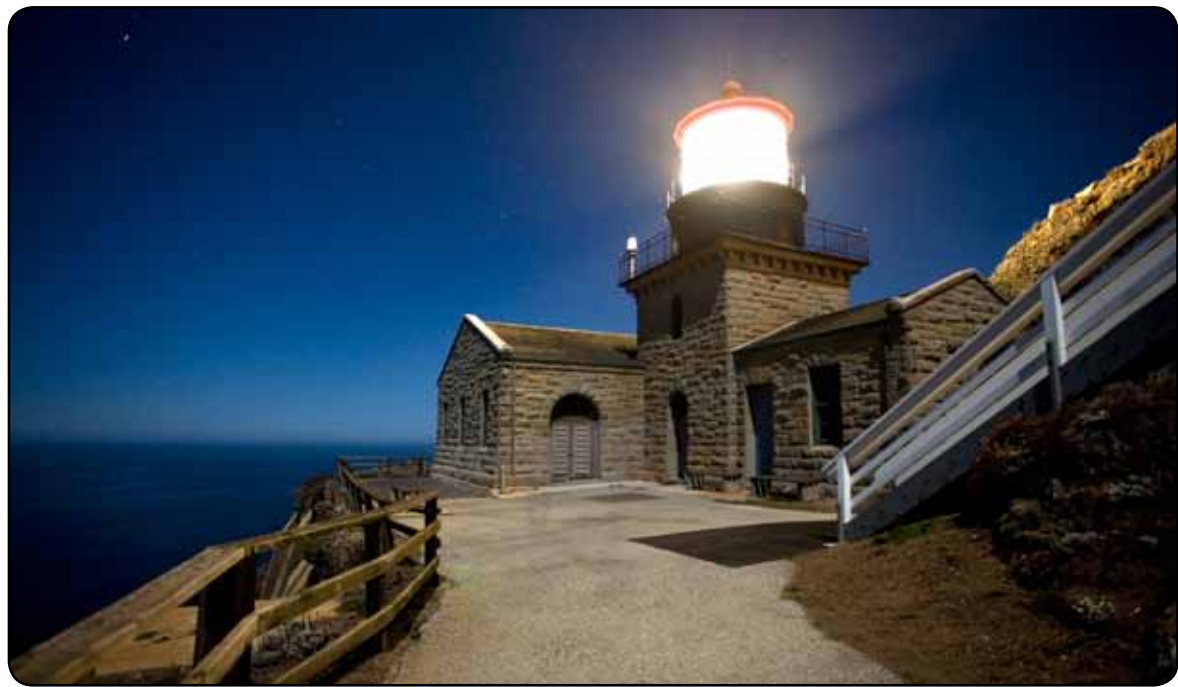
Point Sur Light Station

For information regarding guided tours, check the interpretive notices posted in the state parks. Trained volunteer docents provide an informative and pleasurable tour to the visiting public, and provide access to the Point Sur Lightstation. Visit us on the web at www.pointsur.org