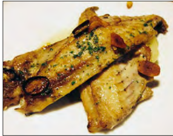
Txixarro al horno con refrito