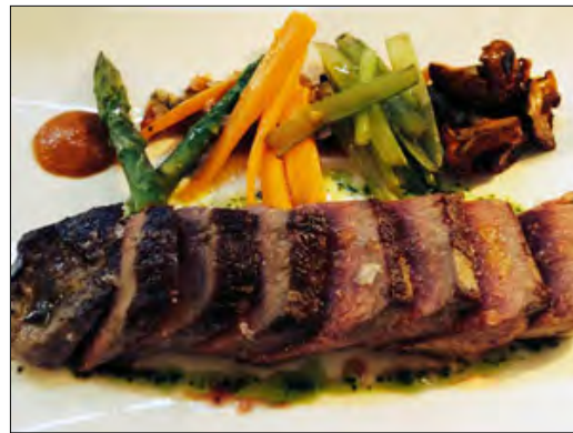
Secreto de Ibérico