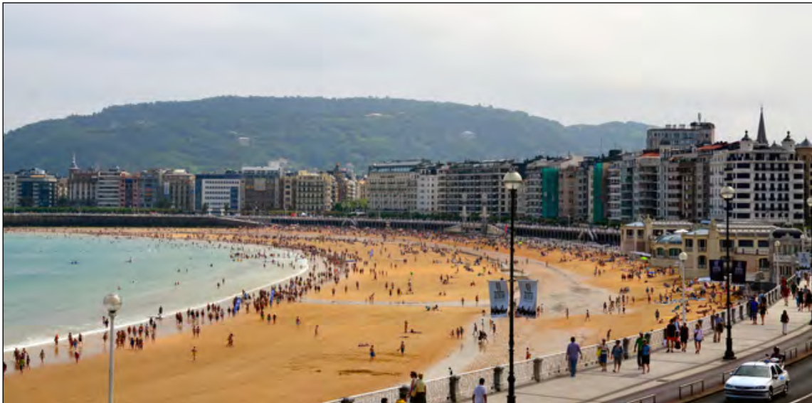
The crowd walking from La Concha to Ondarreta Beach and back on a beautiful “beach day”

Cross the Urumea river via the Zurriola bridge, which you take you to the Alameda del Boulevard, which marks the limit between the old and new sections of the city and in summer fills with musicians playing around the gazebo, cyclists and folks filling its outdoor cafés. This avenue will lead you to the Alderi-Elder Park, facing the sea, where you'll see the elegant City Hall, Ayuntamiento, to your right, built in 1882 as a Casino. You'll now be facing stunning La Concha beach.