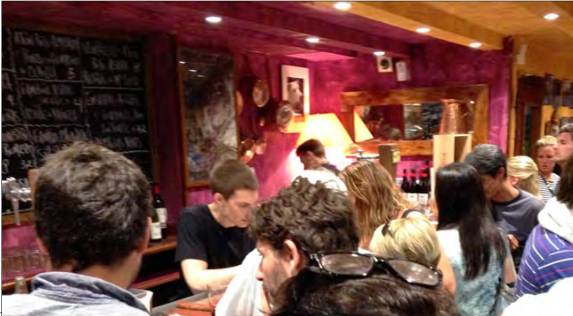
San Temo is closed Mondays and Tuesdays for lunch.