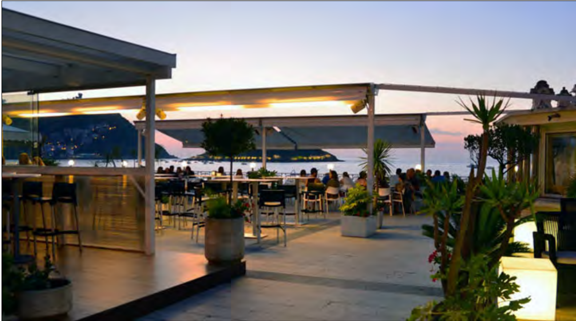
The La Perla Spa terrace overlooking La Concha Bay, late afternoon

The spa is sheltered by the roof of an eclectic building dating from the beginning of last century, designed to cater to European nobility and with unmatched views of the Concha Bay. Inside you will find 4,500 square meters of cutting-edge technology for sports circuits, physical therapy, everything to do with seawater ( www.la-perla.net ).