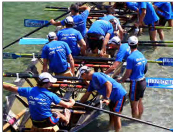
Crews preparing for the summer races on La Concha Bay