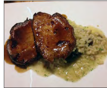
Lomo de cerdo asado con arroz

We recently tried it and enjoyed our summer lunch of vegetable bisque, cod branade, grilled sardines, boneless pork ribs, strawberry Clafoutis and rice pudding, along with house wine, water and bread, all for the princely sum of 23€/person (on Saturdays and Sundays, 16€ during the week). We could have opted for their 6-course, small plates tasting menu for 42€, + VAT, with a wine pairing option for 16€/person.