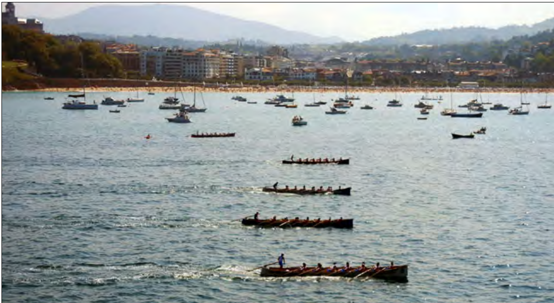
View of La Concha Bay from the terrace of Bokado during the summer regatta