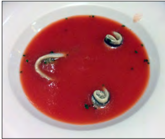
Gazpacho de sandia con antxoas

IXO group are noted for, and it offers a bargain priced, 3-course lunch menu, although it is a set menu with only two choices for each course.