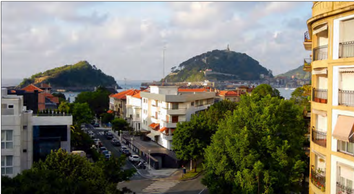
View of Monte Urgull from a superior room at the Hotel Codina