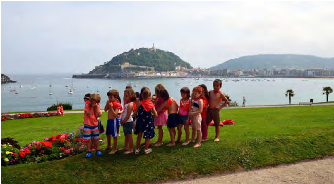
On the grounds of the Miramar Palace, overlooking La Concha Bay

July and August are the busiest months of the tourist season, when most Spaniards take their month long vacations; so lodging will be at a premium. Please book ASAP. The winters are very rainy. September is the ideal month. Early June is also good, as the high season rates normally don't start until July 1. The water will be warm enough for swimming (although it's a bit too nippy for timid tastes), but it does rain quite a bit, for every four days in San Sebastián, perhaps only one will be a great beach day!