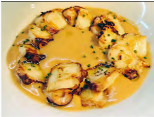
Pulpo a la brasa con espuma de cachelos