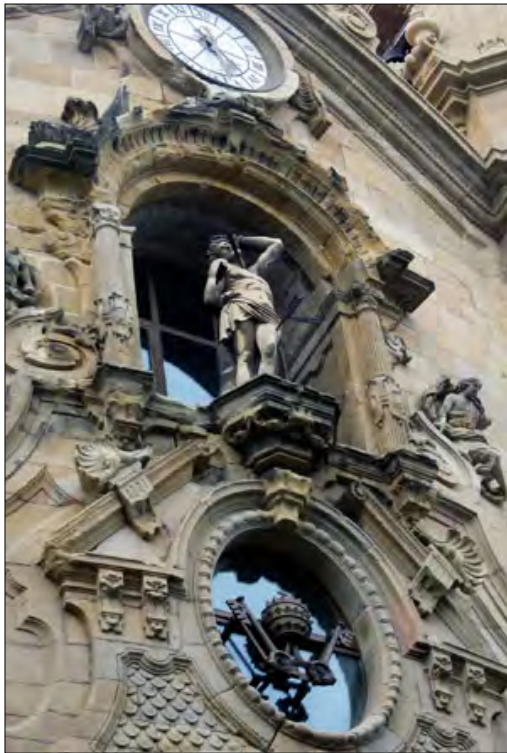
Basílica de Santa María del Coro

At the other end of town, you'll find the Catedral del Buen Pastor , built in 1887 in neo-Gothic style, intended to mimic the great medieval churches of Germany and France. From its main façade you can see the façade of the Basilica of Santa Maria del Coro in the distance.