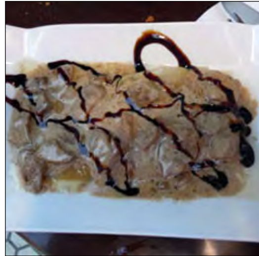
A gastronomic delight from Ramuntxo Berri