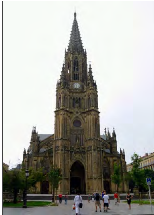
Catedral del Buen Pastor

The ethnographic San Telmo Museum in the Old Quarter, in Plaza Zuloaga, reopened after many years of extensive renovations. The architecture of the brand new pavilion is quite unique. Inside you'll see artifacts related to Basque culture, along with interesting temporary exhibits. Open Tuesday-Sunday from 10:00-8:00, closed Mondays, January 1 and 20 and December 25. Open on bank holidays. General admission is 6€, free on Tuesdays ( www.santelmomuseoa.com ).