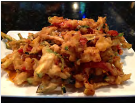
Verduritas en tempura