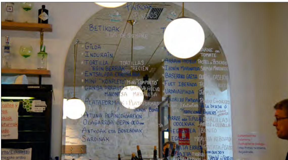
The menu is on the mirror at Bodega Donostiarra

Peña y Goñi 13, across from Ramuntxo Berri bar, with picture windows painted in bright blue, this lively spot, an old wine warehouse, again, drawing a primarily local crowd, is known for its Gilda , Donostia's signature pintxo consisting of an anchovy, green chili and olive on a toothpick. The "Gilda" is a reference to the Glenn Ford, Rita Hayworth film, Gilda , of 1946. Another favorite is the Indurain (as in the 5-time Tour de France champion Navarran cyclist), a pintxo of albacore, with six peppers and a slice of raw onion. It also serves delicious individual potato omelets, tortilla española , that can be prepared with ham, chorizo or even cheese, all made to order.