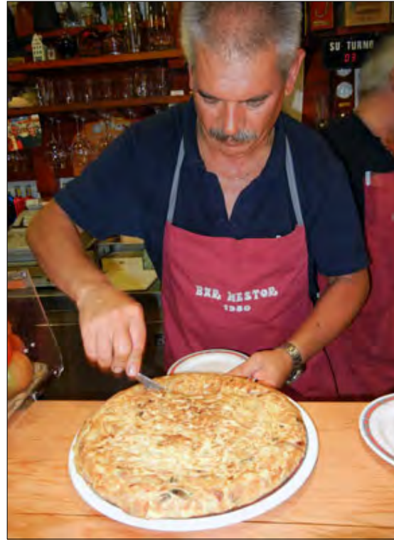
Waiting for the famous tortilla de patatas at Bar Nestor

Or come here to sit at one of the two wood tables to feast on a plate of garden fresh tomatoes and their acclaimed chuletón , a charcoal grilled steak of Galician aged beef. Closed Mondays ( barnestor.com ).