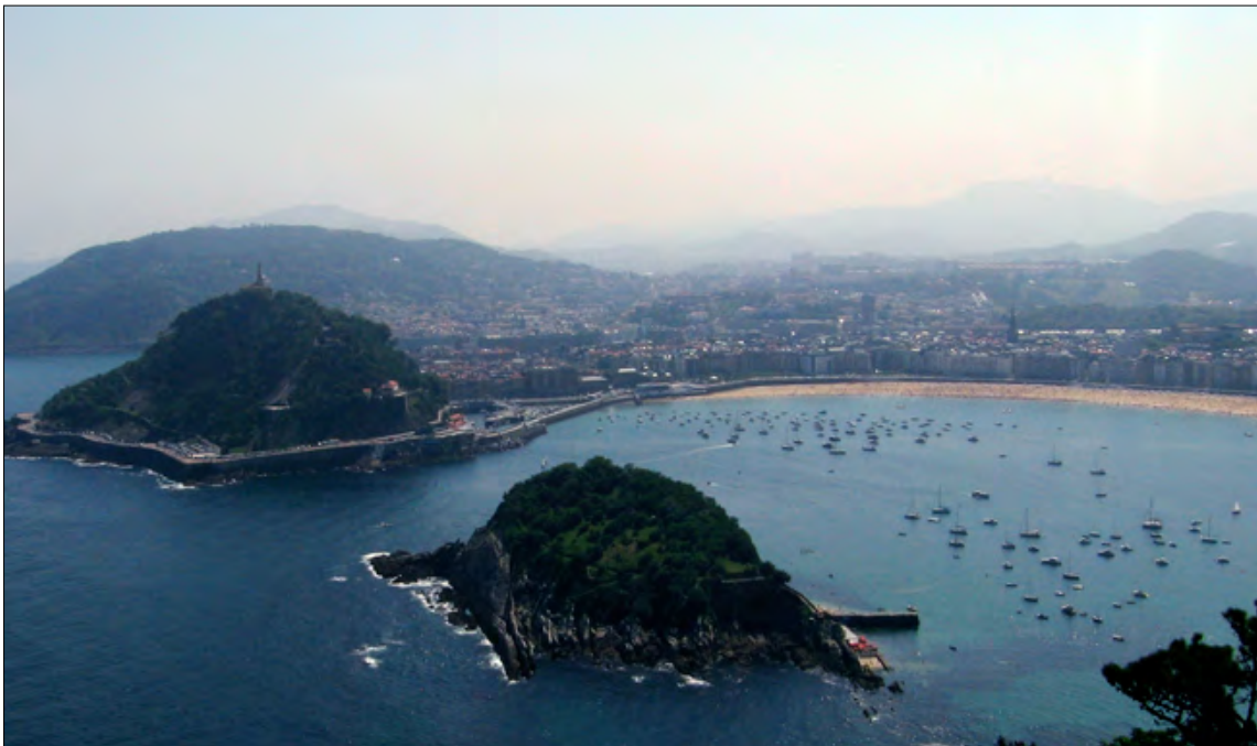
The view of La Concha Bay from Mount Igueldo

The funicular to Mount Igueldo operates during the spring from 11:00 to 8:00 on weekdays and 10:00 to 9:00 on weekends. In June it's open from 11:00 to 8:00 weekdays and 10:00 to 10:00 on weekends. In July it's open from 10:00 to 9:00 weekdays and 10:00 to 10:00 on weekends. August hours are from 10:00 to 10:00 and September hours are from 10:00 to 9:00 daily. Closed on Wednesdays in winter.