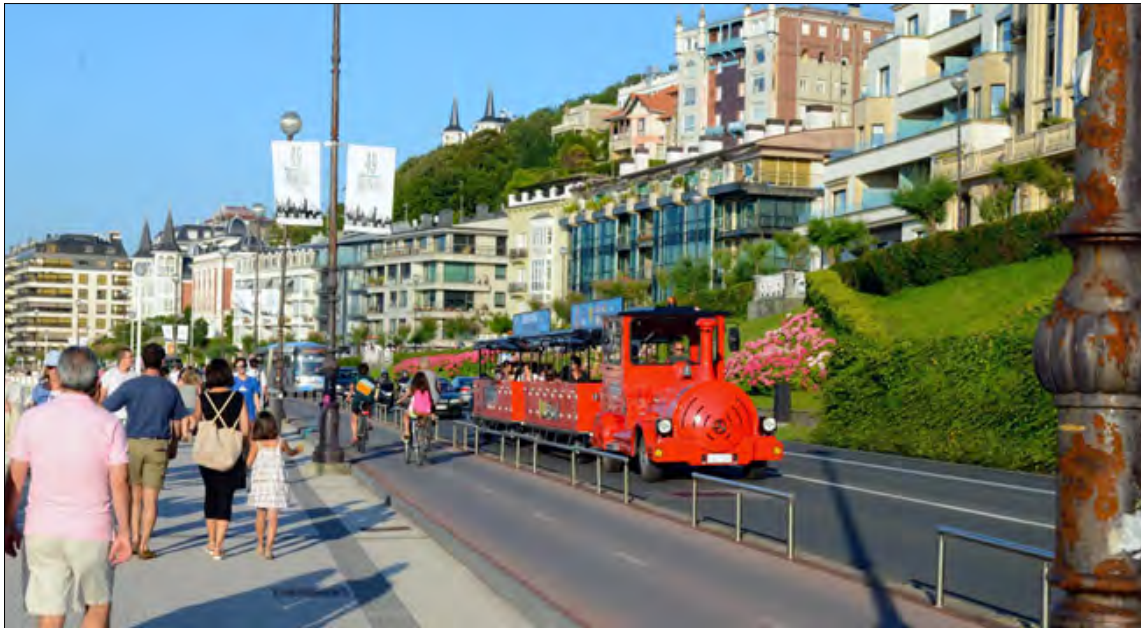
The Txu-Txu Train traveling along La Concha promenade toward Ondarreta Beach

You can purchase tickets at the Tourist Office at Boulevard, 8.