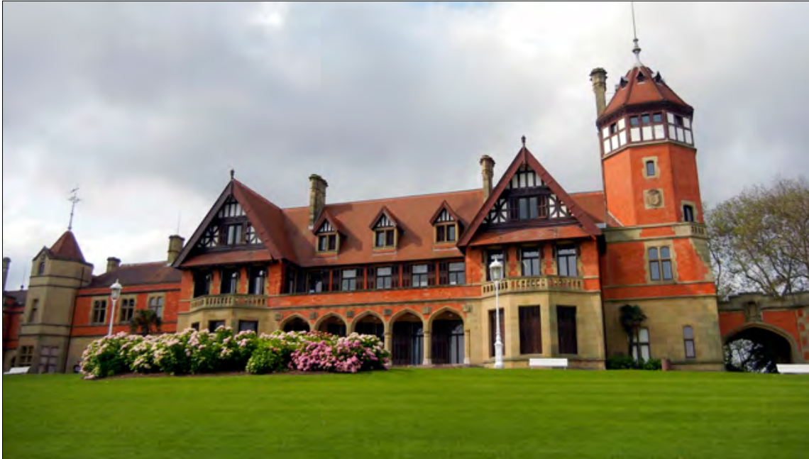
Miramar Palace, the Royal Residence

Cottage style by British architect Selden Wornum. The Palace was built at the Regent Queen's own expense because she didn't want it to be a burden to the people who gave her such a warm welcome during her summer holidays here. The palace is not open to the public but the beautifully manicured grounds are free to all to visit. I love to come here on Sunday mornings to sit on a bench, read the paper and soak up the breathtaking views of this perfect, scallop shaped bay-just gorgeous!