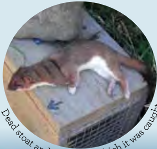
Dead stoat and the trap in which it was caught

Please do not move or tamper with traps as they are specifically located to achieve maximum results. There is a safe sample trap for you to have a look at beside the viewing platform at the fossilised forest.