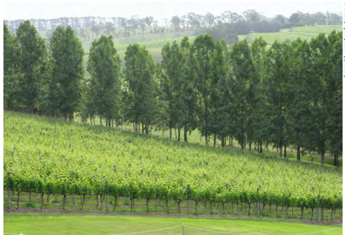
lisargold member fodor.com

visit is October through December, when the weather is mild and summer crowds have yet to arrive. There are several wineries in the region, including the historic Seppelt vineyard and winery at Great Western, about 16 miles east of Halls Gap, which offers fascinating tours of its underground wine cellars.