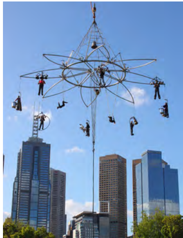
A Barnes member