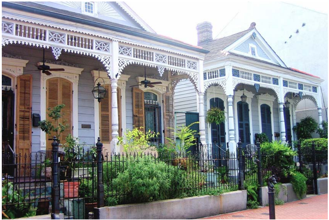
Stephen11.30, fodor.com member

bilingual menu include pommes de terre soufflées (fried potato puffs), pompano en papillote (baked in parchment), and baked Alaska. Tourists generally sit in the front room, but walking through the grand labyrinth is a must. Be prepared for lackluster service. A jacket is preferred, but casually dressed diners can order most of the classic menu at the adjoining Hermes Bar. ☒ 713 St. Louis St., French Quarter ☎ 504/581-4422 🌐 www.antoines.com 📅 Reservations essential ☺ No dinner Sun. $36.